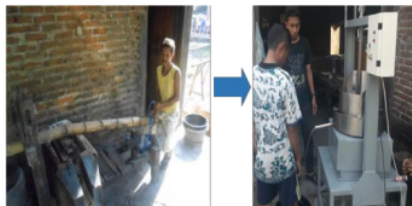
Figure 5. before and after using the machine

Community Service Activities (PKM) carried out by the author and the team focused on helping to overcome the problems of partners, namely the Brem Small and Medium Enterprises (SMEs) group in Madiun district. The problem experienced by partners is in the process of pressing the starch of glutinous tape for the raw material for making brem