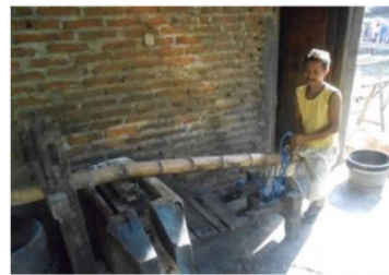
Figure 1. Conventional Brem pressing process in partner SMEs

The problem faced by partner SMEs is in the process of pressing raw materials. This is because the process of pressing the raw material for brem (glutinous rice) to extract the juice is done manually, using simple tools such as square wooden placemats and levers made of bamboo. This causes the process of squeezing the raw material for brem (glutinous rice) which is less hygienic and takes a relatively long time (30 minutes/5 kg). So far, this group of SMEs often has difficulty meeting market needs due to the limitations of inadequate production equipment. This can cause Brem's order to be rejected if ordered in a short time and large quantities.