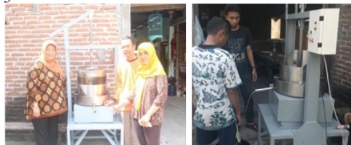
Figure 3. Brem pressing machine

Based on the results of manufacturing and assembly, it is obtained Brem pressing machine as shown in Figure 3